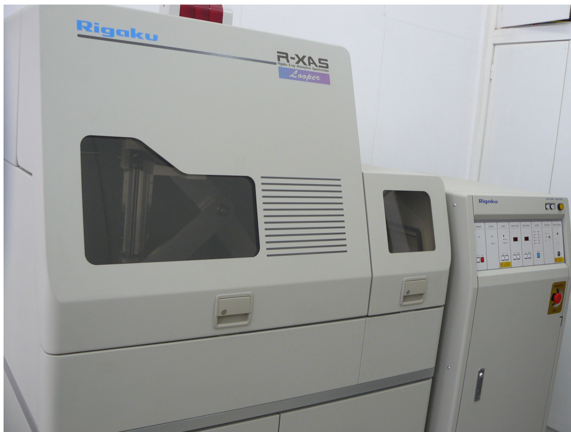
Fig. 1. The Rigaku XAFS spectrometer installed in NIMP, in the Surface Science and X-ray Spectroscopies group from the Nanoscale Condensed Matter Physics Department

Primary and refined EXAFS data analysis software